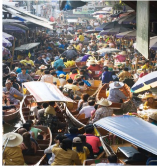
Food & Health