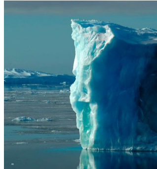
Energy & Climate