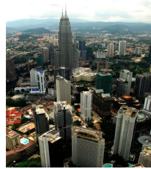
Construction & Housing